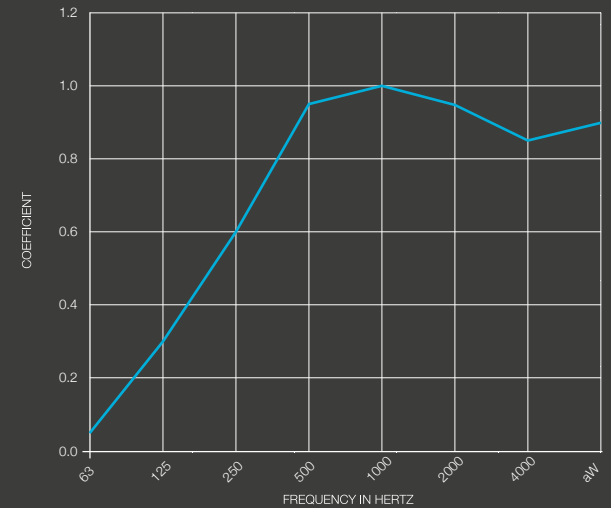
Woodstock, Contract Height 50mm